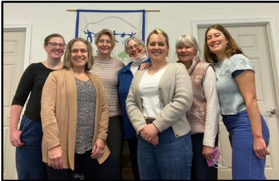
2023 Healthy Peninsula Staff

The mission of Healthy Peninsula is to mobilize, support, and collaborate with community partners to improve the health of all residents of the Blue Hill Peninsula, Deer Isle and Stonington. The towns served are Blue Hill, Brooklin, Brooksville, Castine, Deer Isle, Penobscot, Sedgwick, Stonington, and Surry.