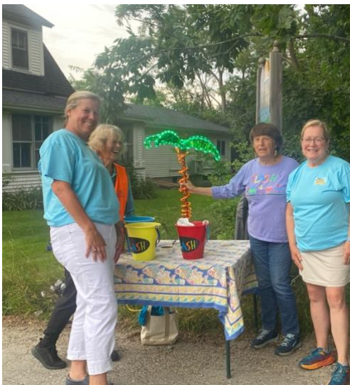
Staffing the entry to our 2023 Flash! In the Pans Benefit Concert with fellow Board members