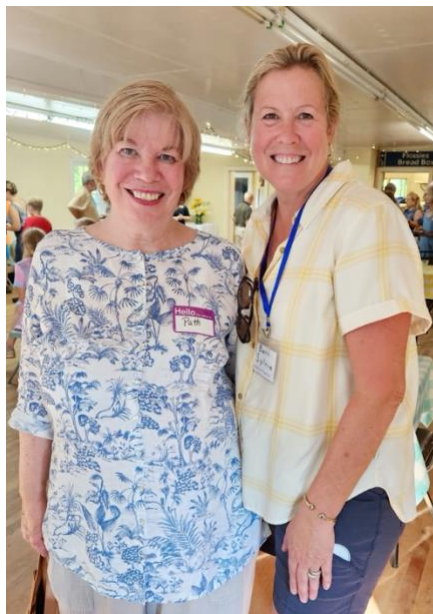
Celebrating Donors and Volunteers at our 2023 Appreciation Celebration