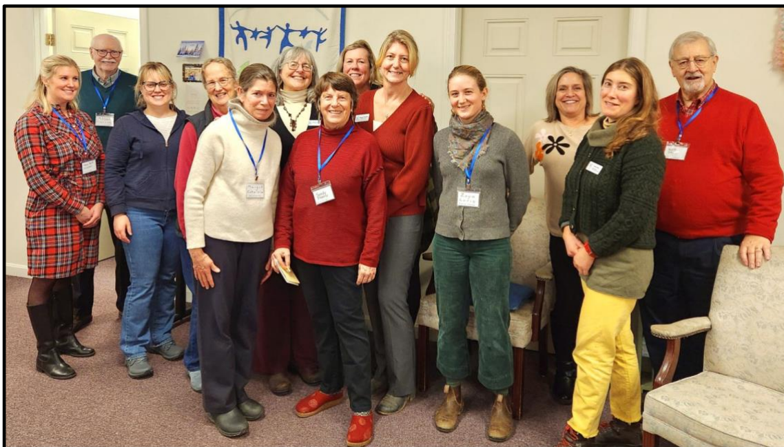
2023 Annual Meeting with (incoming and outgoing) Board and Staff